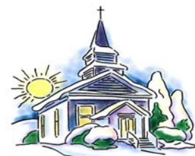
Christmas and New Year Day Worship Service

Please note that there will only be one worship service (10:00am) on December 25 and January 1. The 8am service will continue through December 18, and then resume on January 8.