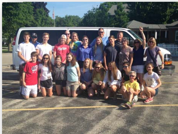
Participants leaving for Pennsylvania on Saturday, June 18th 2016