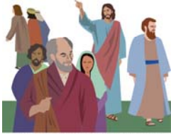
Jesus Sends Out His Disciples

Join us on Sunday, September 10 , as we look to the coming year with our annual Commissioning Sunday celebration. The music, Sunday school, youth and all of the ministries of the church will be at the forefront as we rejoice in all God has done, is doing, and will do in the life of our church. This is also the Sunday in which Confirmation will re-start, Sunday school will resume its normal multi-class structure, and the choir will resume leading our worship. There will only be one service (10am) on this day, and it will be followed by an ice cream social hosted by the Fellowship Committee!