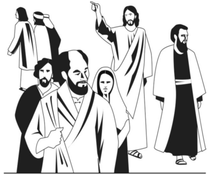
Jesus Sends Out His Disciples

Please note that, due to the Commissioning Sunday celebration, there will be no chapel service on 9/8 . The chapel service will return to its normal 8am time beginning on 9/15.